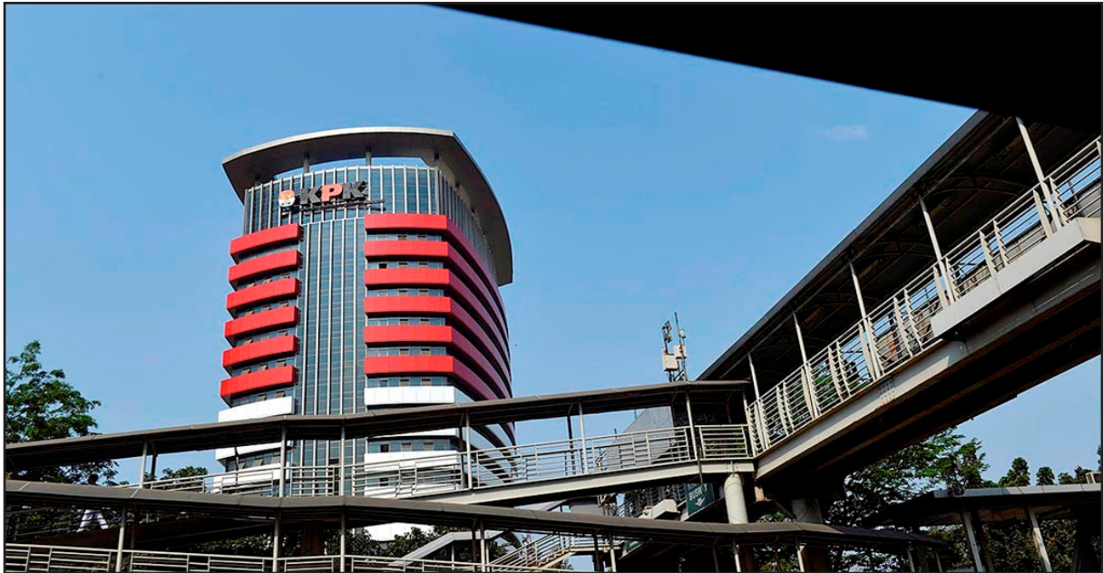
KPK Building in Indonesia